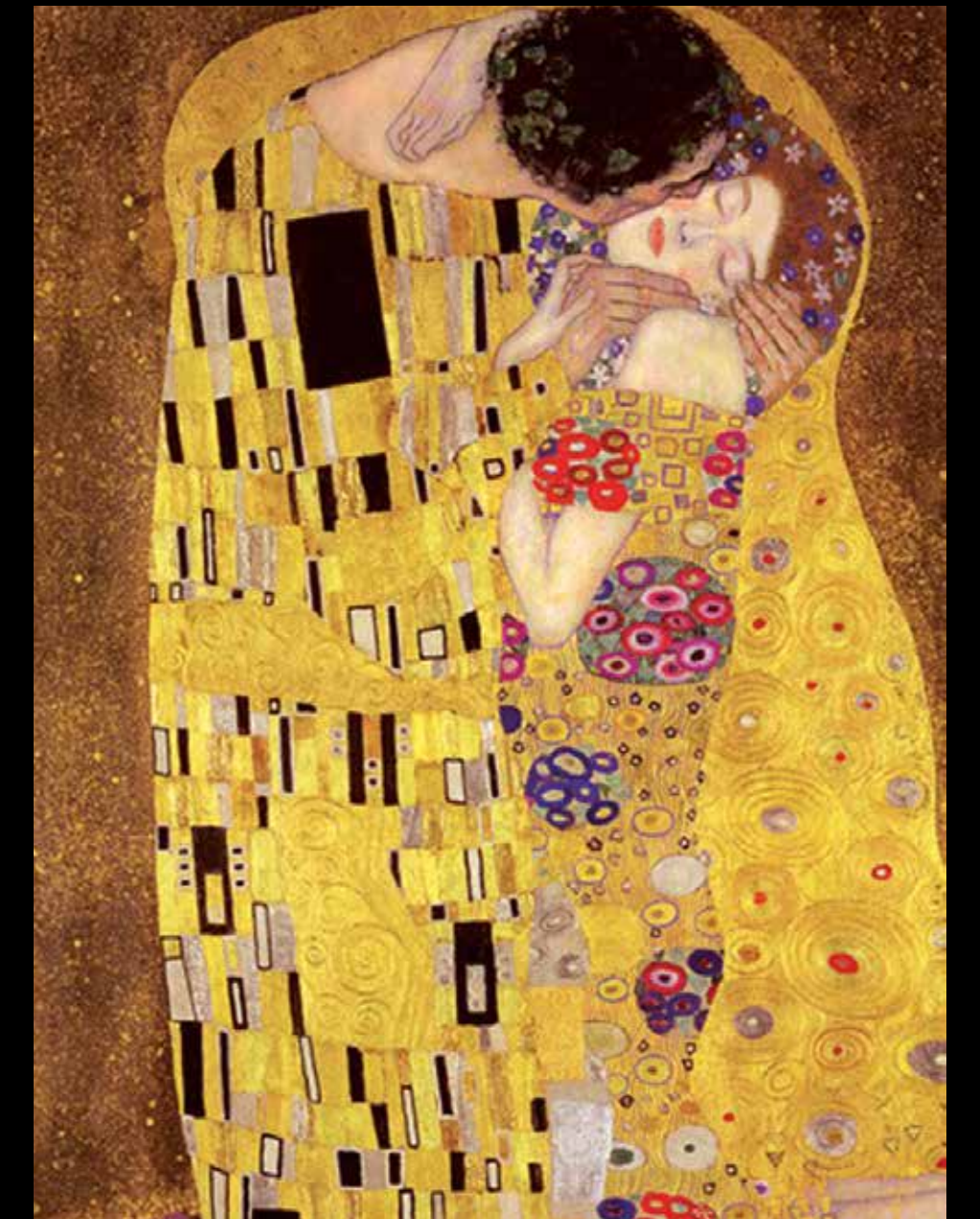
THE KISS, 1907